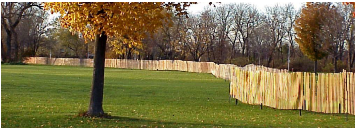
5. Use lines to lead eye into a photo