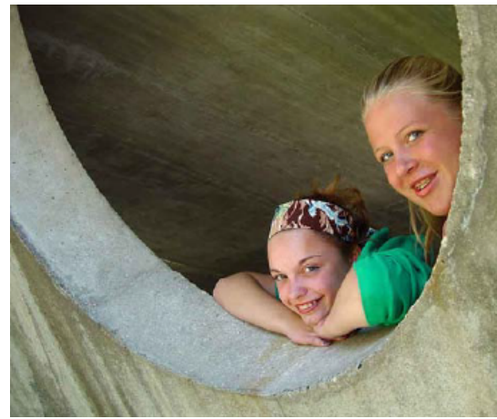
4. Frame your subject