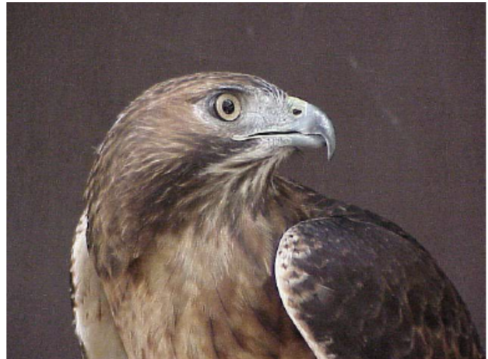
2. Take subject against a simple background