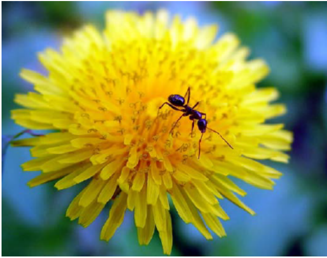
1. Get close